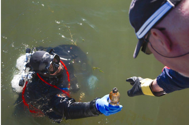
Rauman Laitesukeltajat at Reksaari island.