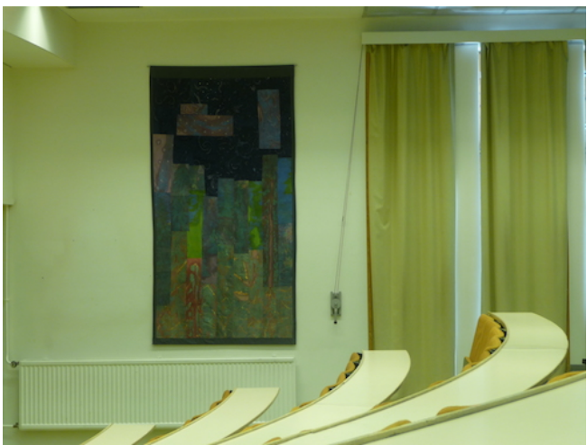
Night Sky in Uotila school