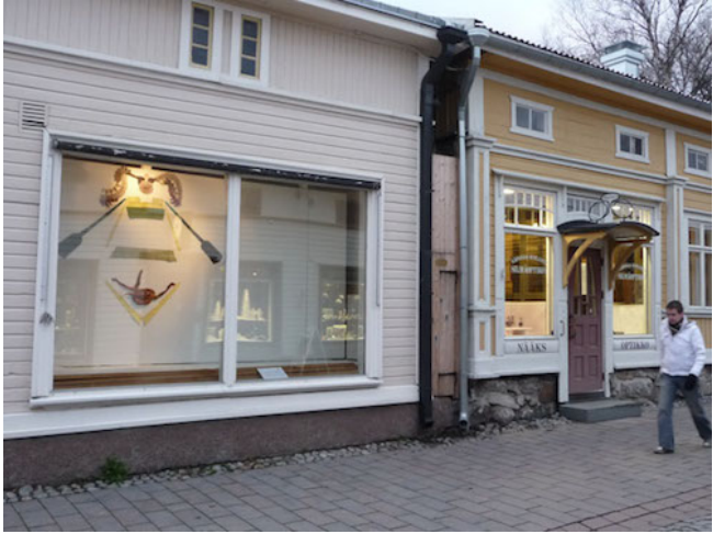
Casualties in Silmäoptikot Palmu Oy window.