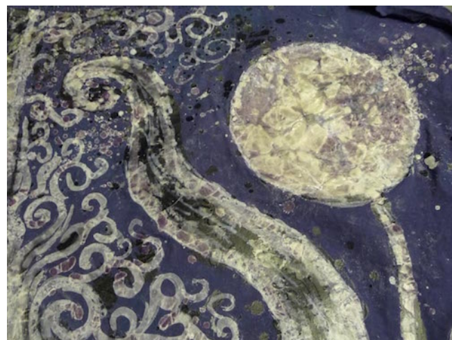
Detail before wax removal