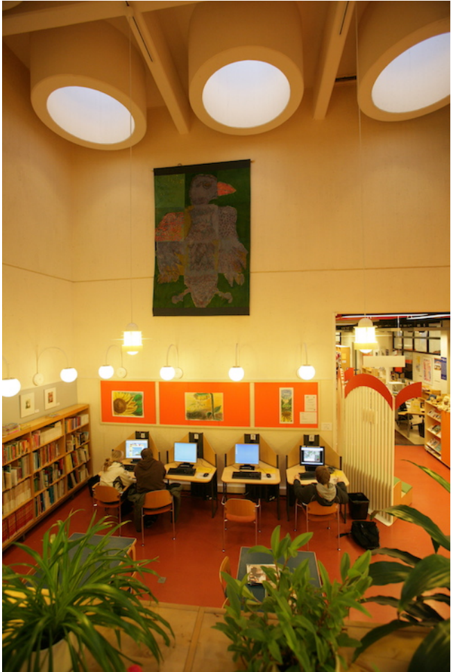
Pori public library