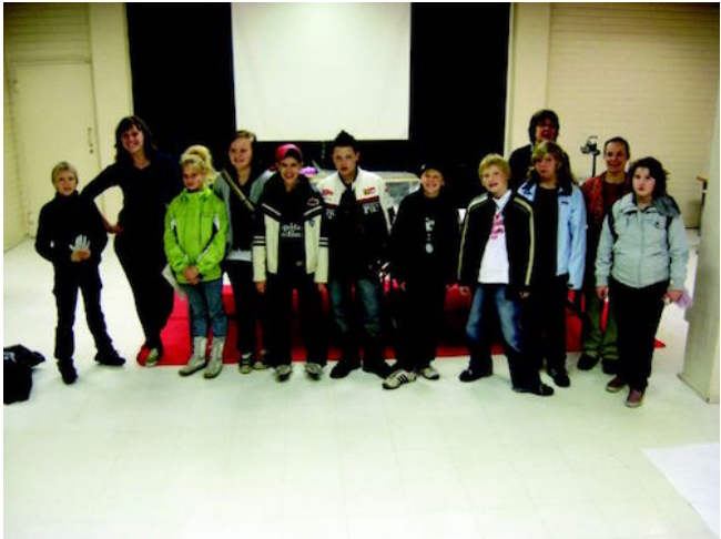
Makers of Over the Forests and Seas