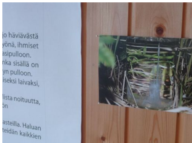
San Peter 2009 installation details