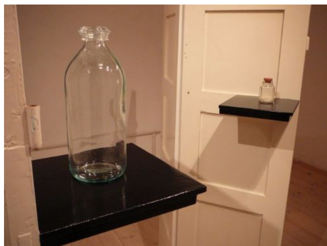
Chosil Kil, True Romance 2008, raindrops in a glass bottle in "Export Wood – Wood Expert" exhibition

During the residency in January–February 2008, the South Korean artist Chosil Kil completed Cocoon No.3, a symbolic shelter in the unique Old Rauma, a World Heritage Listed town for being the largest received Nordic wooden city centre.