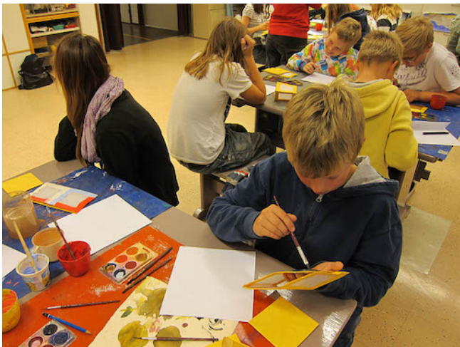
Wish You Were Here –workshop at Rauma Freinet School