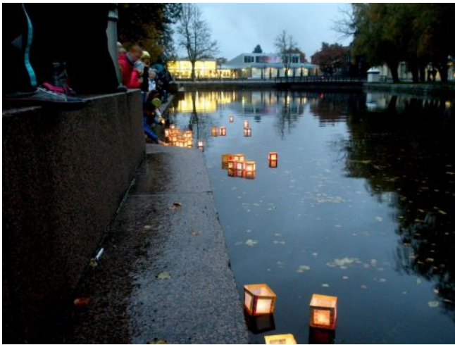
Lantern launching 10th Oct 2011.