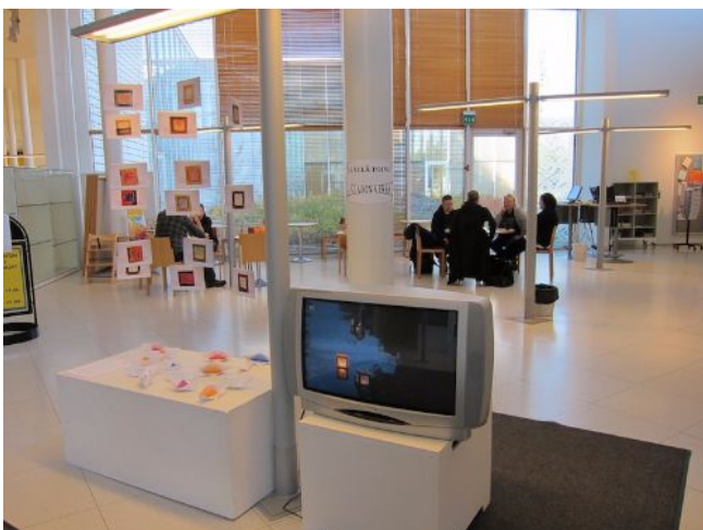
Wish You Were Here in Rauma Town Library

Wish you were here was a workshop and a happening with Rauma Freinet School disciples. We invited citizens to a lanterns launching happening on Monday 10th October at sunset 18.40 by the Venetian stairs of Rauma canal. Happening also dignified national author's Aleksis Kivi day, Finnish Literature Day and Energy Saving Week.