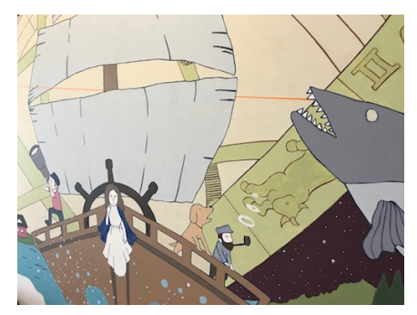
Detail of the wallpainting.